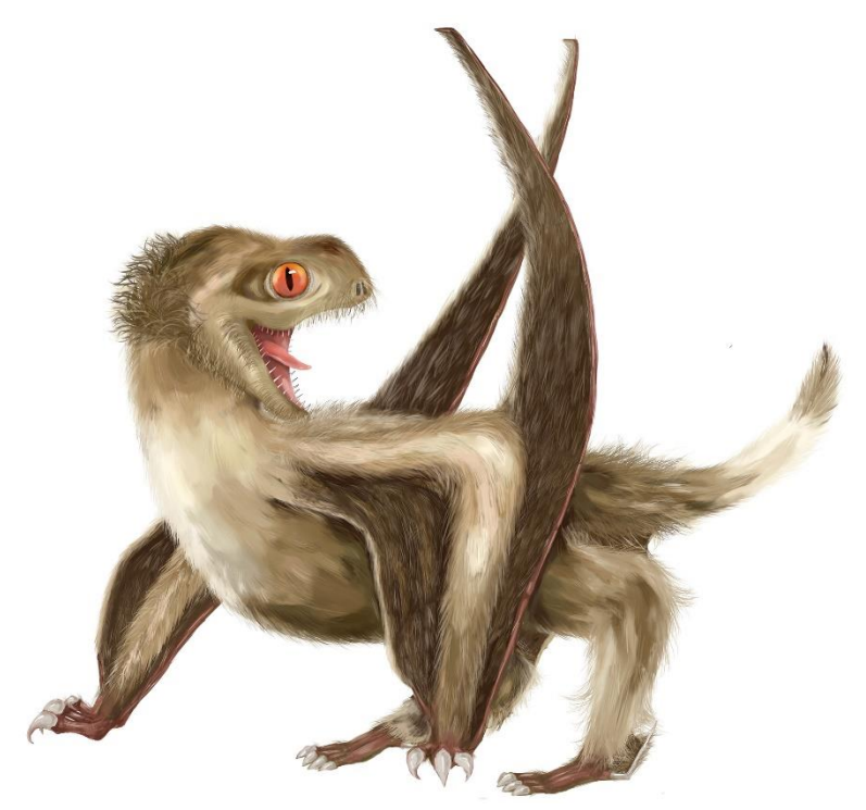
Figure 1. The pterosaur studied has four different feather types over its head, neck, body, and wings, which would have generally had a ginger-brown colour. Reconstruction by Yuan Zhang.